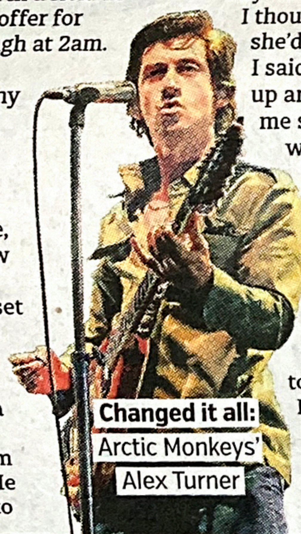
Changed it all: Arctic Monkeys' Alex Turner

MC: I was an Indiana Jones fanatic. I remember my mum at a party saying, 'He refused to answer to