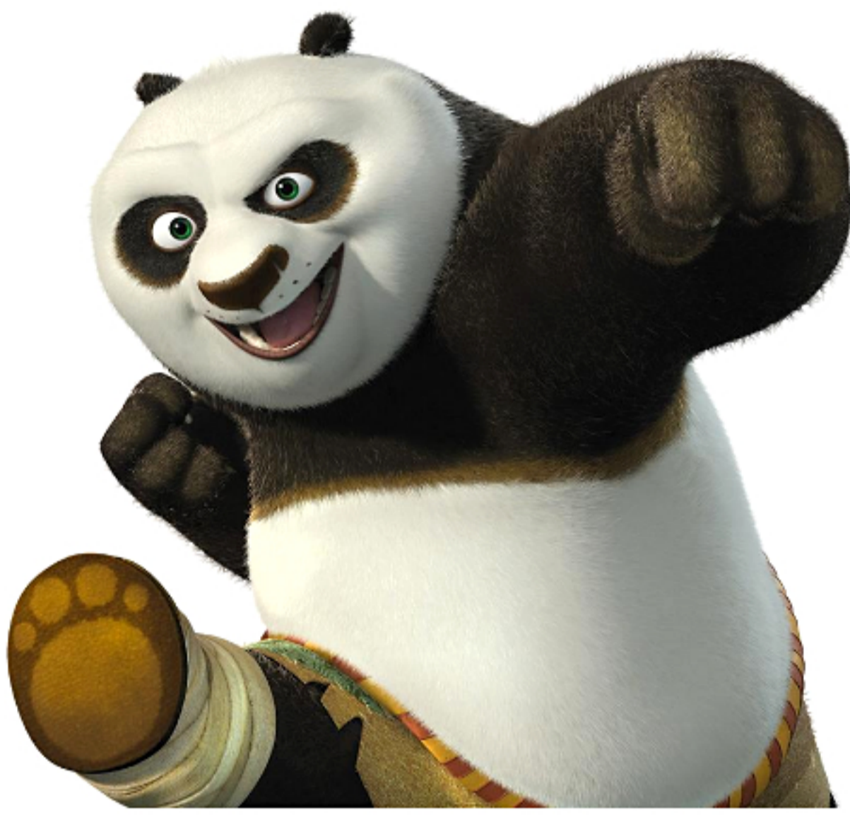
Fancy that: Whittaker dressed as Kung Fu Panda

Oh, loads. It's brilliant, people go to town. One girl in Cardiff was on her way to uni when she saw us filming. She was wearing our Doctor T-shirt with the rainbow on it. She shouted, 'I'm wearing the T-shirt!'